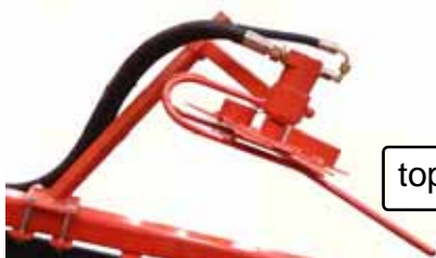
top cutting knife